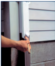
Chalky Aluminum Siding