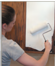
Cabinets & Doors