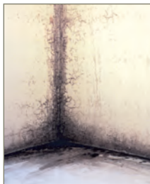
Mold & Mildew